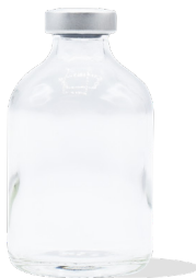
SEV50 50 cc