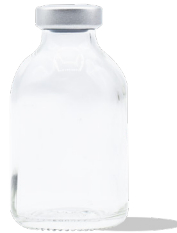
SEV30 30 cc