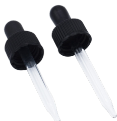
ITEM #80138 4 ML GLASS DROPPER TIP