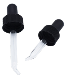
ITEM #80153 15 ML GLASS DROPPER TIP