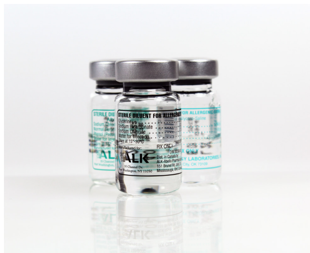
GLYCERIN 4 mL