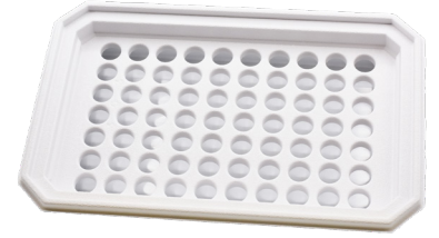
ITEM #80323 RACHMAN TRAY, LARGE #303