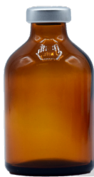
SEV50-AMB 50 cc Amber