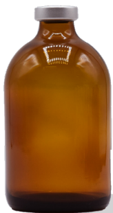
SEV100-AMB 100 cc Amber