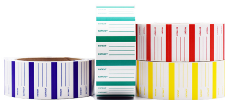
ITEMS #80230, #80232, #80235, #80250 VIAL LABELS