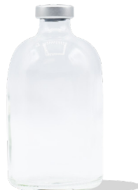
SEV100 100 cc